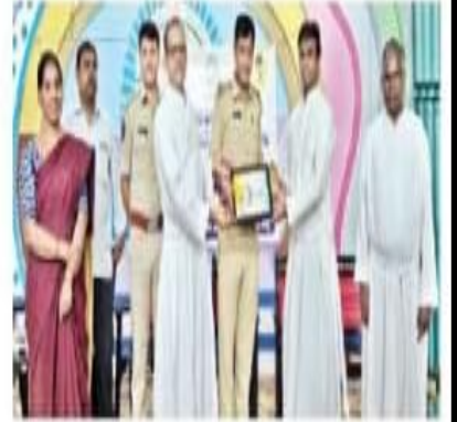
ముఖ్య అతిథికి మొమెంట్ అందజేస్తున్న ప్రిన్సిపాల్